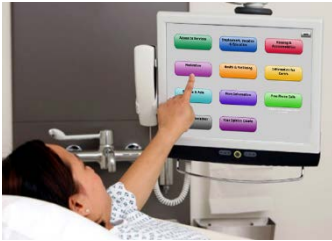
Multi-media terminal in hospital, billing via contactless payment.

RFID systems are already in widespread use in hospitals, for example in access control applications. Beyond that, contactless identification methods are used by medical staff during ward rounds, and for documentation purposes, which can lead to real cost reduction. One domain, that should not be disregarded, is the use of RFID to help patients feel more comfortable during their stay at the clinic.