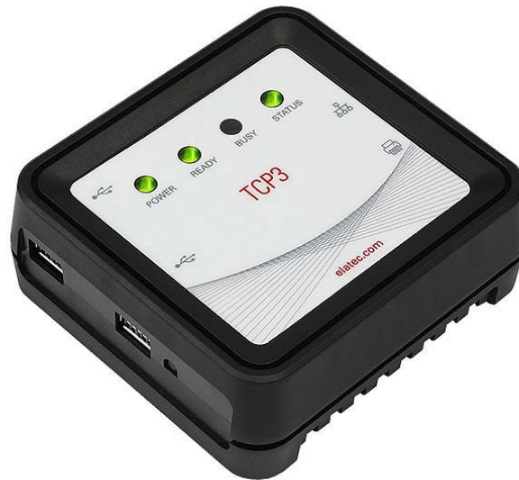
TCP3 authentication / release station top view

ELATEC RFID readers enable organizations to extend the use of their employee identification badge to authenticate for applications beyond physical access. This includes most multi-function printers and some single-function printers. Unfortunately, not all printers and devices have support for the direct connection of a USB proximity card reader, such as those with no USB port. In these situations, the ELATEC TCP3 authentication / release station extends ID card-based capabilities such as authentication and pull printing to any printing device regardless of the manufacturer, make or model.