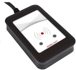
TWN3 LEGIC NFC (inlay customizable)

TWN3 LEGIC NFC and TWN3 LEGIC NFC M are transponder readers designed for easy integration into various applications. Both devices support either USB or RS-232 communication just in dependence on the connection cable. TWN3 LEGIC NFC is available as a ready-to-connect desktop reader in a slim line black or white housing, whereas TWN3 LEGIC NFC M is an OEM board (PCB) without housing for direct integration into embedded applications.