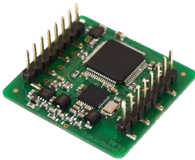
TWN3 Mini Reader MIFARE NFC top view*