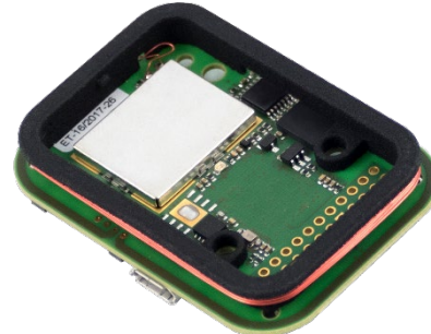
TWN4 MultiTech 3 M PCB bottom view

TWN4 MultiTech 3 M integrates RFID (125 kHz and 13.56 MHz) and NFC capabilities into a compact but powerful reader. Its reduced size combined with optimized read/write performance makes it the perfect reader for all applications where small size and full performance matters, e.g. print solutions, driver identification, POS integration and many more. Furthermore, TWN4 MultiTech 3 M provides access to most common host interfaces such as USB, serial (TTL) or I 2 C which are readily accessible through an on-board connector.