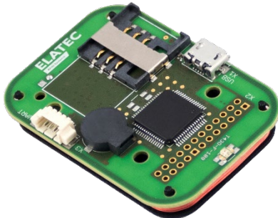
TWN4 MultiTech 3 M PCB top view