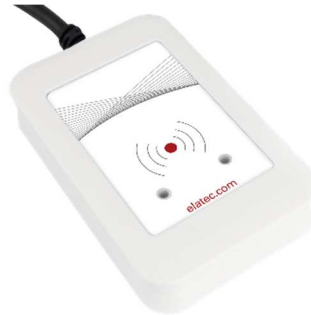
Desktop version (inlay customizable)