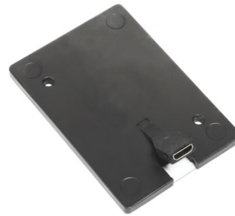
TWN4 Slim – rear view

The new TWN4 Slim is Elatec's smallest compact and flat RFID reader – it's smaller than an ID-1 card. TWN4 Slim supports a huge range of LF and HF technologies (125 kHz and 13.56 MHz). With the support of NFC and Bluetooth Low Energy the reader supports mobile use cases for data communication and authentication. It can be operated as a standalone unit connected using a standard cable with a micro USB plug to PCs and other devices with USB interface.