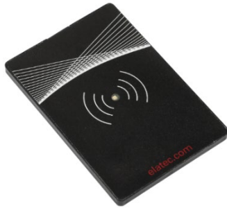
TWN4 Slim – front view