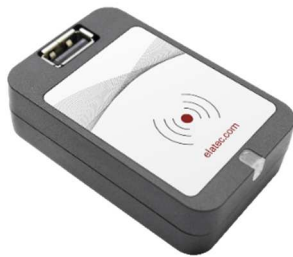
TWN4 USB Front Reader Top view (inlay customizable)