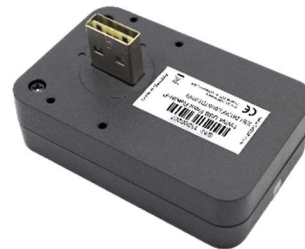
TWN4 USB Front Reader Bottom view (360° mounting possibility)

The TWN4 USB Front Reader integrates RFID (125 kHz and 13.56 MHz), NFC and Bluetooth Low Energy capabilities into a compact but powerful reader. It can be easily connected to an external USB port. Furthermore, it has a rotatable USB interface, which offers a 360° mounting opportunity, as well as a USB-Hub which can optionally be disabled. Its reduced size combined with excellent read/write performance makes it the perfect reader for various applications including but not limited to print solutions, single sign-on.