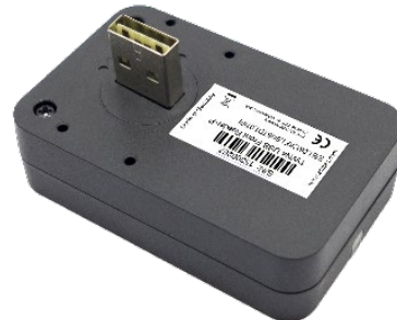
TWN4 USB Front Reader Bottom view (360° mounting possibility)

The TWN4 USB Front Reader integrates RFID (125 kHz and 13.56 MHz), NFC and Bluetooth Low Energy capabilities into a compact but powerful reader. Thanks to its patented turnable USB connector, which offers a 360° mounting opportunity, the reader can be easily connected to an external USB port. Furthermore, it is equipped with a USB hub that can optionally be disabled. Its reduced size combined with excellent read/write performance makes it the perfect reader for various applications, including but not limited to print solutions and single sign-on.