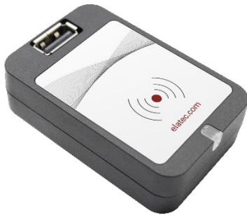
TWN4 USB Front Reader Top view (inlay customizable)