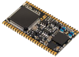
Version C0 (SMT) 31 x 17.8 x 2.7 mm