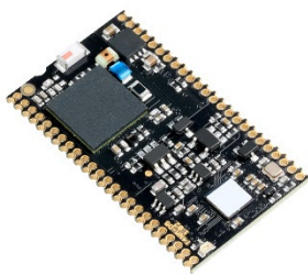
PCB top view