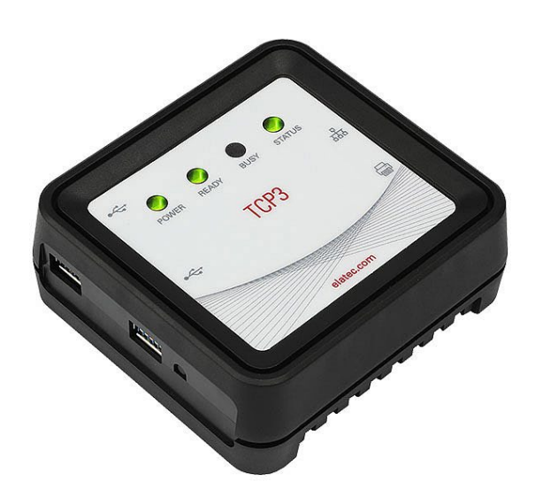
TCP3 (exemplary illustration)

The main purpose of the TCP converters is to enable RFID authentication and access control for devices that lack a USB port, from older single-function printers to industrial robotics. They can be connected on one end to a Local Area Network (LAN) and on the other end to an RFID reader via USB cable. When the user presents a card to the reader, the information is sent over the network to a local server and depending on the response, a print job can be released or, in the example of industrial robotics, operator authorization granted.