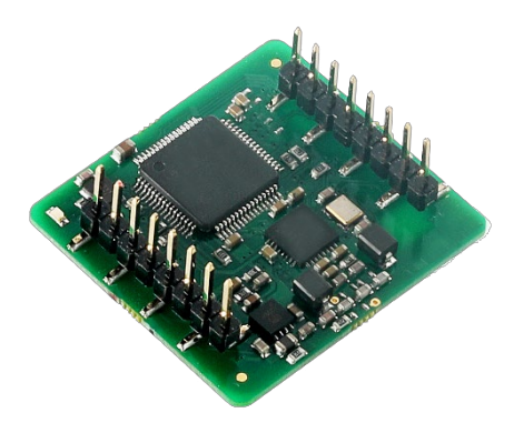
TWN4 MultiTech HF Mini (exemplary illustration)

The RFID modules of the TWN4 MultiTech HF Mini family have been designed for integration into machines, handheld computers or any other device where small size matters. Thanks to their compact dimensions, the modules can be directly integrated into almost any host system. The host communication takes place via SPI or asynchronous serial TTL interface. Besides, the modules offer positions for the placement of two LEDs that can be controlled per software. For applications requiring additional security, an external Secure Access Module (SAM) can be connected.