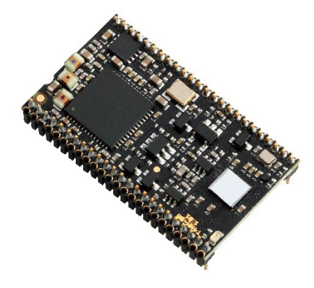
C1 version (THT mounting)

With the TWN4 MultiTech Nano family, ELATEC offers extremely compact RFID modules that are also fully compliant with the TWN4 technology. Their miniature size and low energy consumption give the option to integrate them in smaller battery-powered consumer devices, like tablet PCs, POS terminals or mobile payment systems. Furthermore, their components are mounted on one side only, which facilitates easy placement on the main circuit board. These devices are the ideal solution in case of particular restrictions during the installation (space limitations, metal surrounding the reader antenna, etc.).