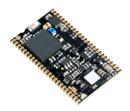
C0 version (SMT mounting) Top view