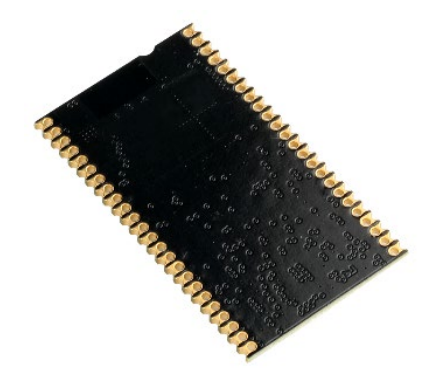
C0 version (SMT mounting) Rear view

With the TWN4 MultiTech Nano family, ELATEC offers extremely compact RFID modules that are also fully compliant with the TWN4 technology. Their miniature size and low energy consumption give the option to integrate them in smaller battery-powered consumer devices, like tablet PCs, POS terminals or mobile payment systems. Furthermore, their components are mounted on one side only, which facilitates easy placement on the main circuit board. These devices are the ideal solution in case of particular restrictions during the installation (space limitations, metal surrounding the reader antenna, etc.).