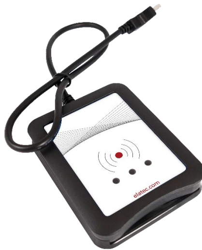
TWN4 MultiTech SmartCard (exemplary illustration)

Multi-frequency RFID reader (LF/HF/NFC) for ISO/IEC 7816 cards