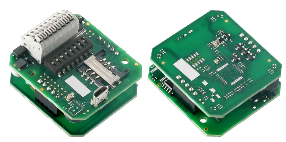
TWN4 Palon Compact M Light (exemplary illustrations)

The RFID readers and modules of the TWN4 Palon Compact family support two RFID frequencies (125 kHz / 13.56 MHz), NFC and Bluetooth Low Energy (BLE). All devices are available with an NXP or LEGIC SM-4200 frontend and support a wide range of interfaces, for instance USB, RS-485 and, optionally, the OSDP protocol. A cost-optimized "light" variant with fewer interfaces and without BLE is also available. Although the readers are general-purpose devices, they are particularly appropriate for time attendance and access control. Depending on the intended application, the readers are available as modules for integration into a host device, as panel mount readers with IP65 protection or as in-wall readers with an IP54 protected housing.