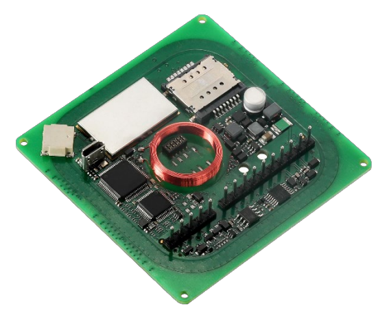
TWN4 Palon Square M LF HF (exemplary illustration)

Multi-frequency RFID module (LF/HF) with NFC support