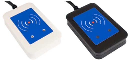
Desktop version (inlay customizable)

The TWN3 MIFARE RFID reader is designed for easy integration into various applications. The device supports either USB or RS232 communication just in dependence on the connection cable and is available as ready-to-connect desktop reader in a slim line black or white housing or as a OEM board (PCB) without housing for direct integration into embedded applications. Readers can be programmed with a scripting language for autonomous execution of even complex commands like login procedures, increment/decrement functions and many more.