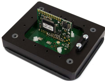
TWN4 MultiTech Panel Desktop version